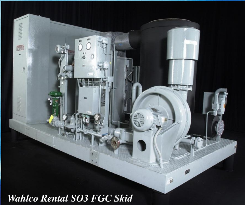
Wahlco Rental SO3 FGC Skid